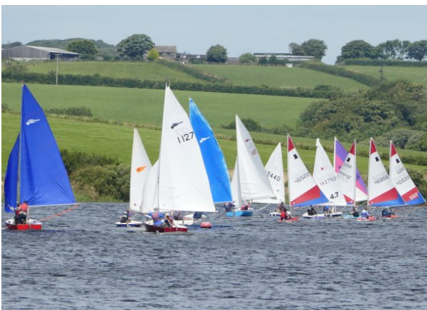
Part of a 20-strong fleet heading up the lake

Sailing is a marvelous sport, which is suited to a wide variety of people. It can range from competitive racing, to gentle afternoon sails on scenic estuaries on sunny days in summer; it really can be exactly what you want to make of it.