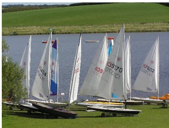
Rigged and ready to go

The 'News and Events' link has text and pictures of what is going on at the club, whilst details of what's been happening in each Sunday's racing can be found in the 'Race Reports' section, for those who do not see the write-ups in the 'Bude and Stratton Post'. There is also a 'Pictures' link, with galleries of photos of sailing on the lake. For those who have not been to the lake before, there are directions on the 'How to Get to the Lake' page, with a link to Bing maps, showing a map of the general area.